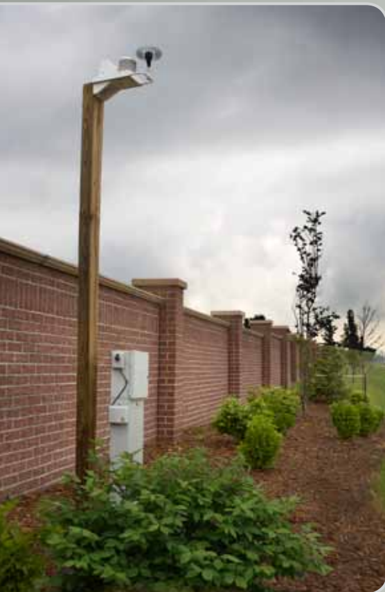
SWAT™ Performance Summary and Technical Report now available at www.irrigation.org