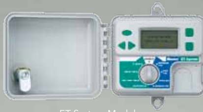
ET System Module